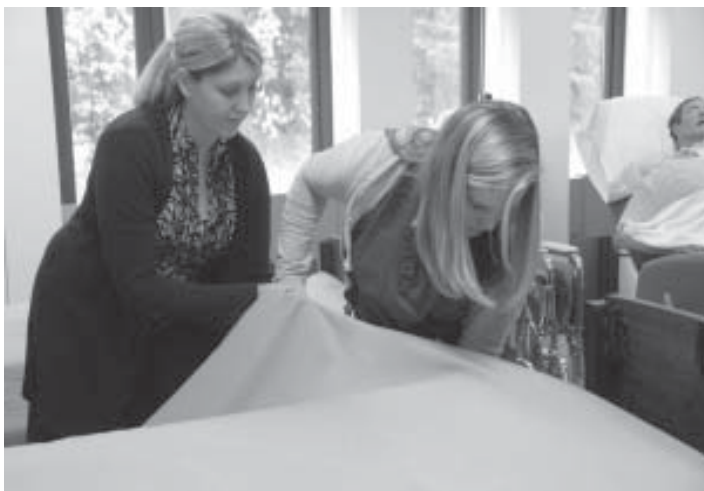
Students learn the proper method of making a hospital bed in the allied health laboratories at Glen Oaks.