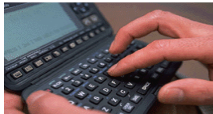
Equipping You For a Brighter Future!