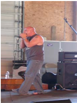
“BAND BASH WAS A GREAT TIME FOR A GREAT CAUSE.”